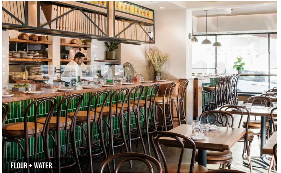
FLOUR + WATER