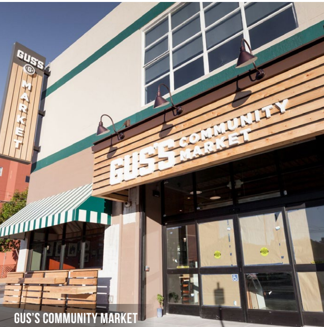
GUS'S COMMUNITY MARKET