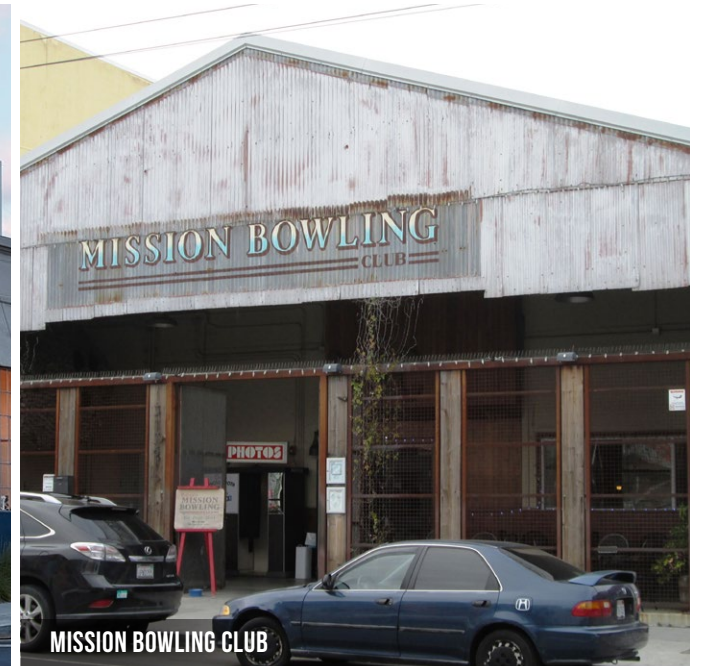
MISSION BOWLING CLUB