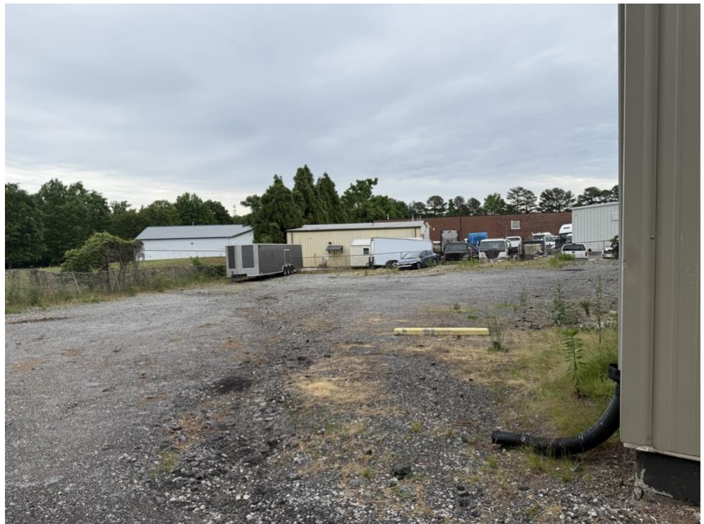
Rear parking lot.