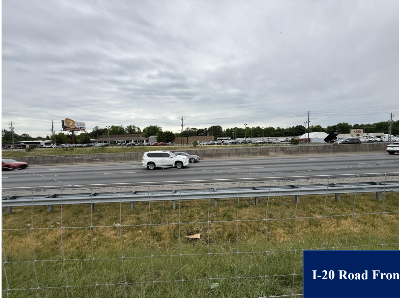
I-20 Road Frontage