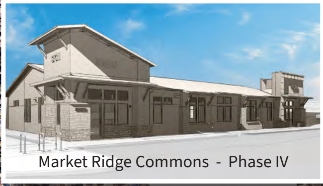
Market Ridge Commons - Phase IV