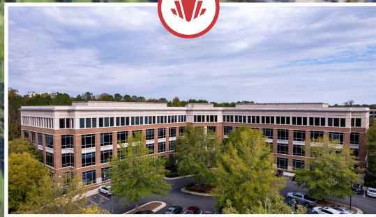
THE EXCHANGE WEST