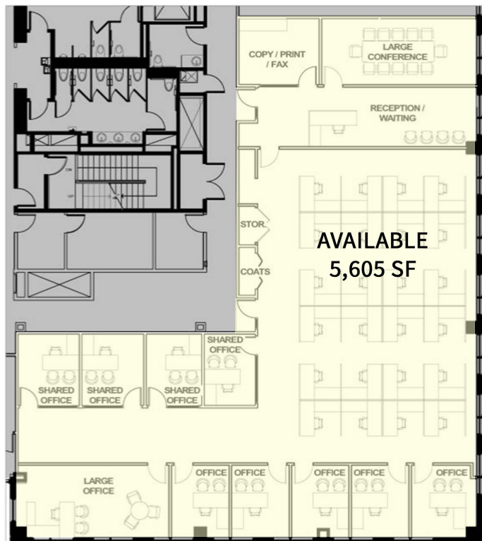
5th Floor 5,605 SF