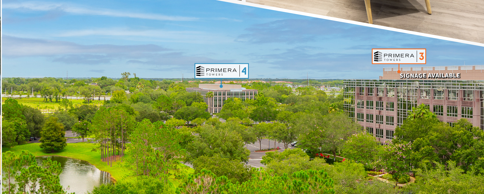
PRIMERA TOWERS 4