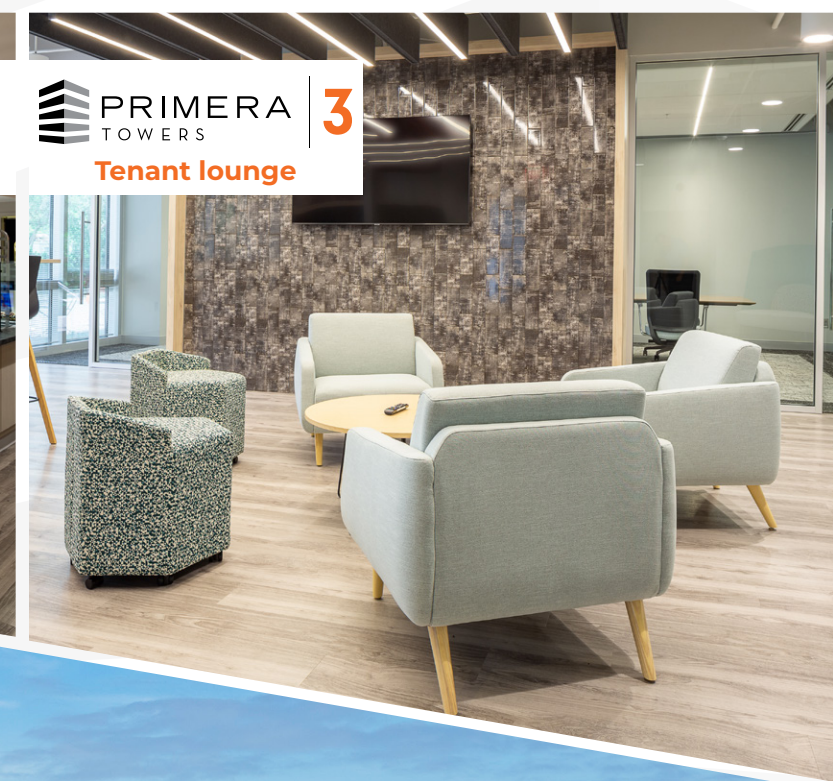
PRIMERA TOWERS 3 Tenant lounge