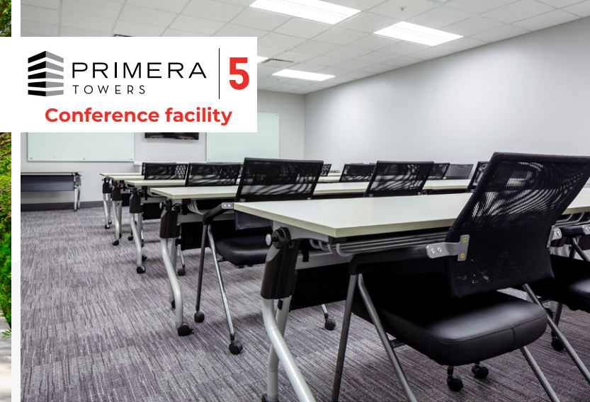
PRIMERA TOWERS 5 Conference facility