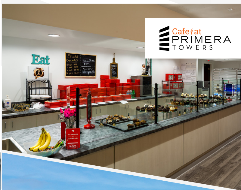
Café at PRIMERA TOWERS