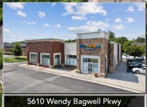
5610 Wendy Bagwell Pkwy

Traffic Volume - 34,149 Wendy Bagwell Parkway / US-278 Heavily traveled retail corridor and main tributary to Atlanta