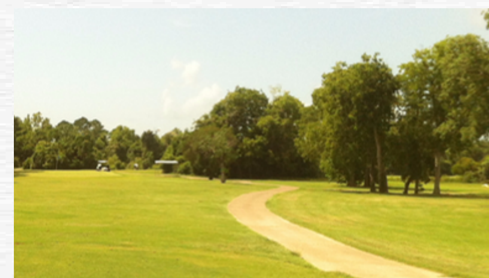
Hillcrest Golf Club – a local destination for golf and social gatherings.