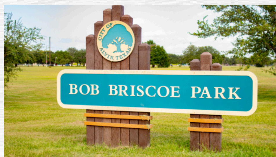
Briscoe Park – a popular community park with trails, sports, and recreation.