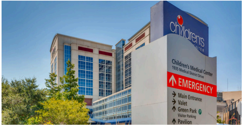
Dallas Medical District