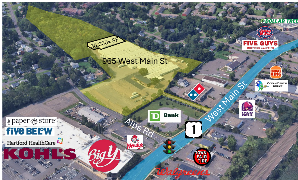
Outline of parcel is approximate