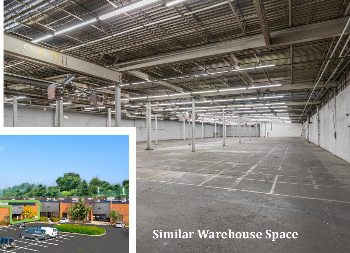
Similar Warehouse Space