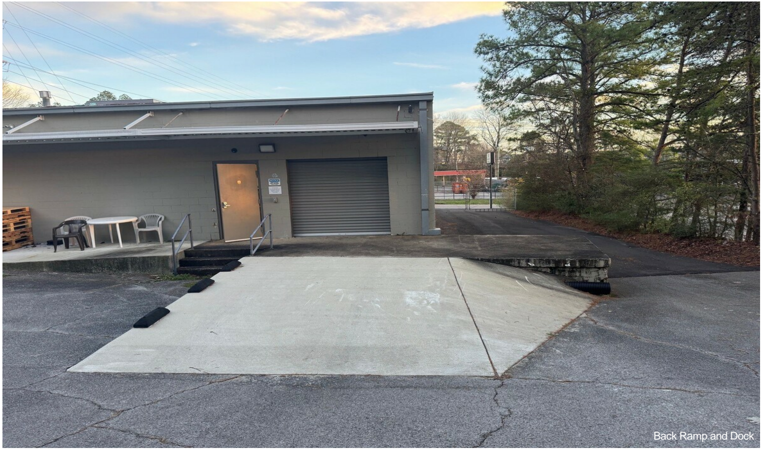
Back Ramp and Dock