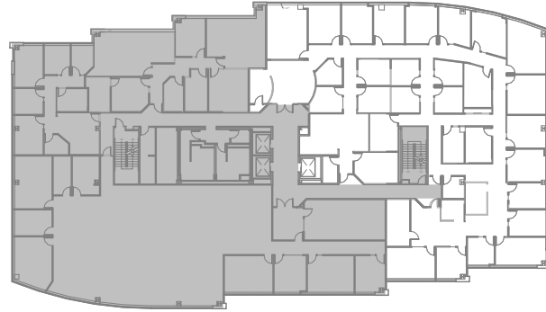
② KEYPLAN 1/64" = 1'-0"