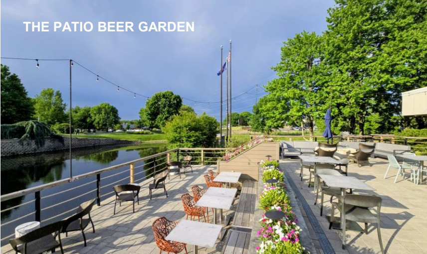
THE PATIO BEER GARDEN