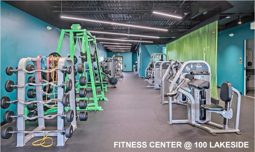
FITNESS CENTER @ 100 LAKESIDE