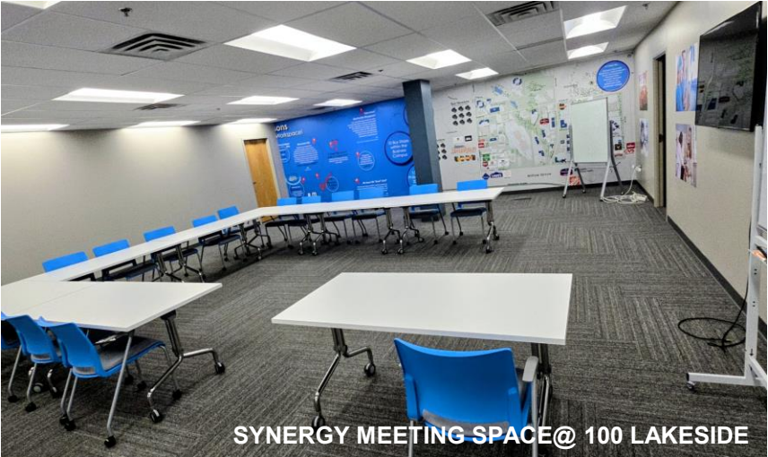
SYNERGY MEETING SPACE @ 100 LAKESIDE