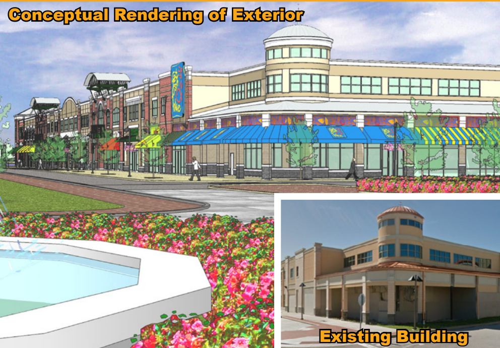
Conceptual Rendering of Exterior