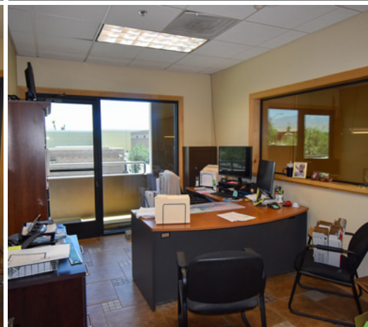
Development Office 2