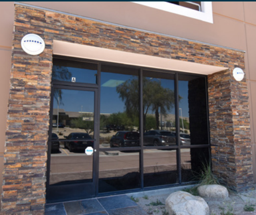
Common Area Entrance