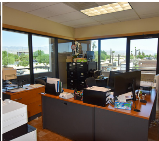
Development Office 1