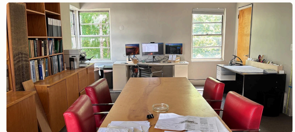
SHARED COMMON & MEETING AREA