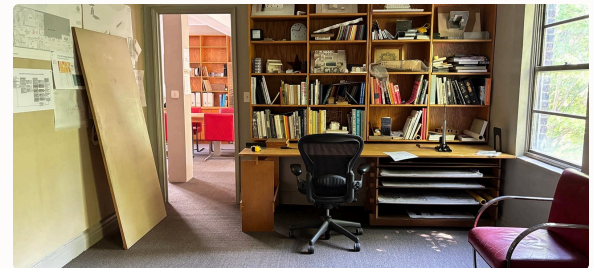
ADJACENT STUDIO — DESIGN PRACTICE