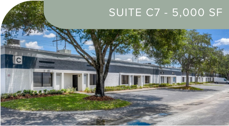
SUITE C7 - 5,000 SF