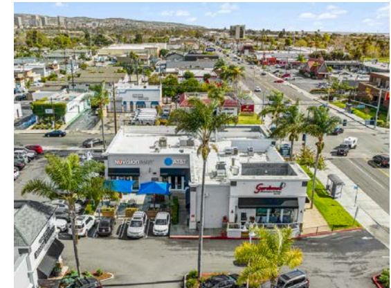
Restaurant Space 1,257 SQ FT + Patio