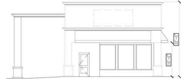
SCALE: 1/8"=1'-0" ELEVATION

LEASEABLE AREA: 1,257 SQ. FT. PATIO AREA: 190 SQ. FT. 837 SQ. FT. DIMENSIONS: SEE PLAN CONST. TYPE: TYPE V-B (NON-SPRINKLERED) ELECTRICAL: 225 AMP 120/208V 3 PHASE 60 AMP 120/240V 1 PHASE WATER: 1-1/2" COLD WATER GAS: 1-1/2" NATURAL GAS HVAC: 1 PACKAGE UNIT (5 TON) W/NATURAL GAS HEATING