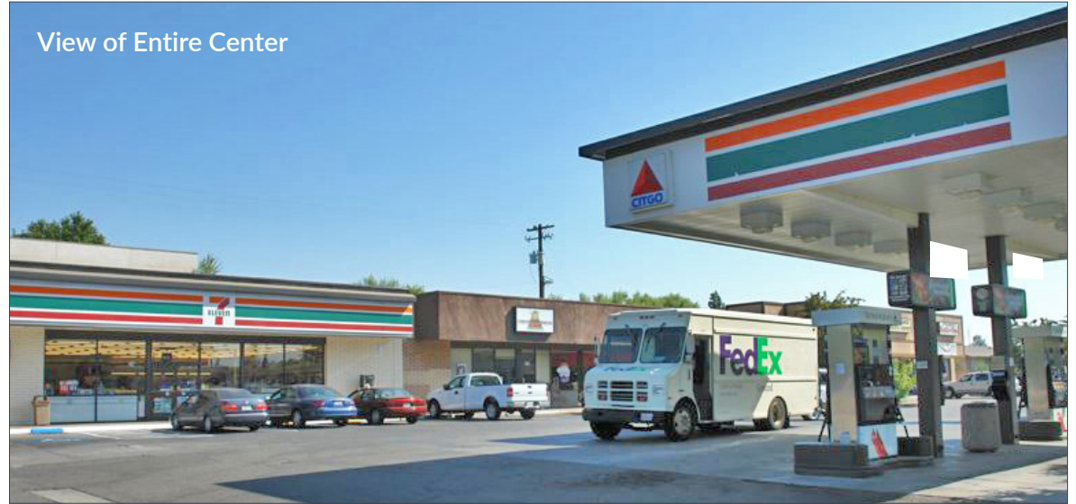
View of Entire Center

Prospective tenants are hereby advised that all uses are subject to City approval.