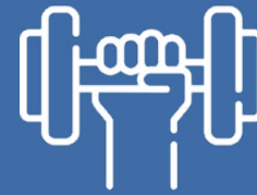
Fitness Center with Showers and Lockers