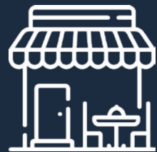
Close Proximity to Restaurants and Retail