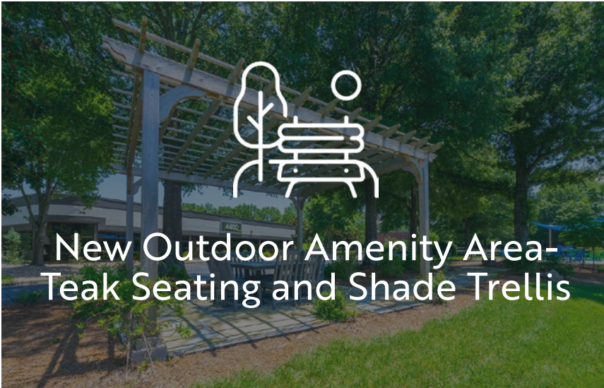
New Outdoor Amenity Area - Teak Seating and Shade Trellis