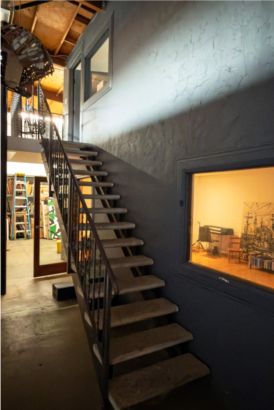
● Stairs to the mezzanine offices