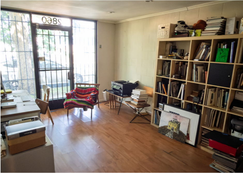
● Main office / reception with entrance from Glenview Ave