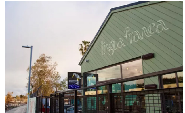
● Lingua Franca