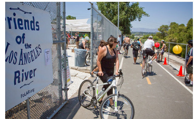
● Frogtown Art Walk