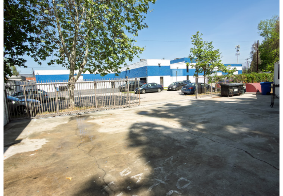
● View towards Glenview from the secure outdoor area