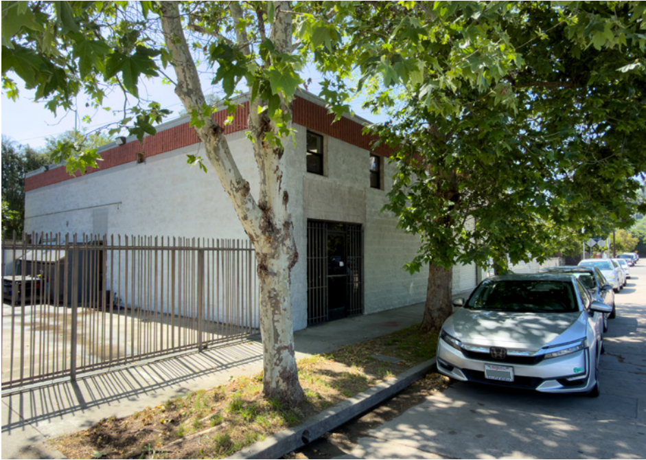
● The main office entrance and the secure outdoor area