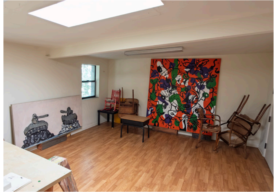
● 3rd office in the mezzanine