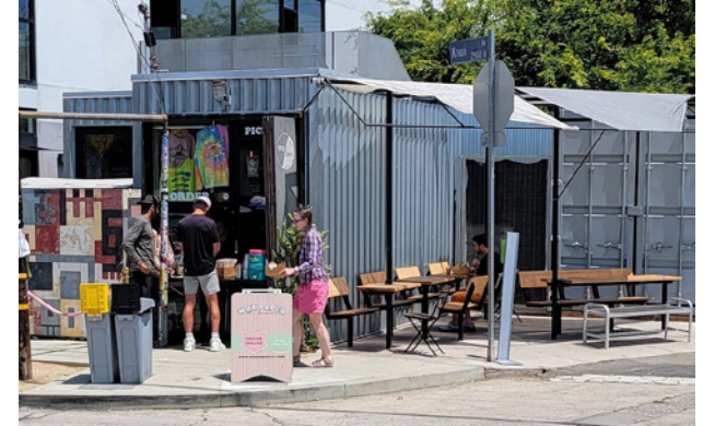
● Wax Paper Co.