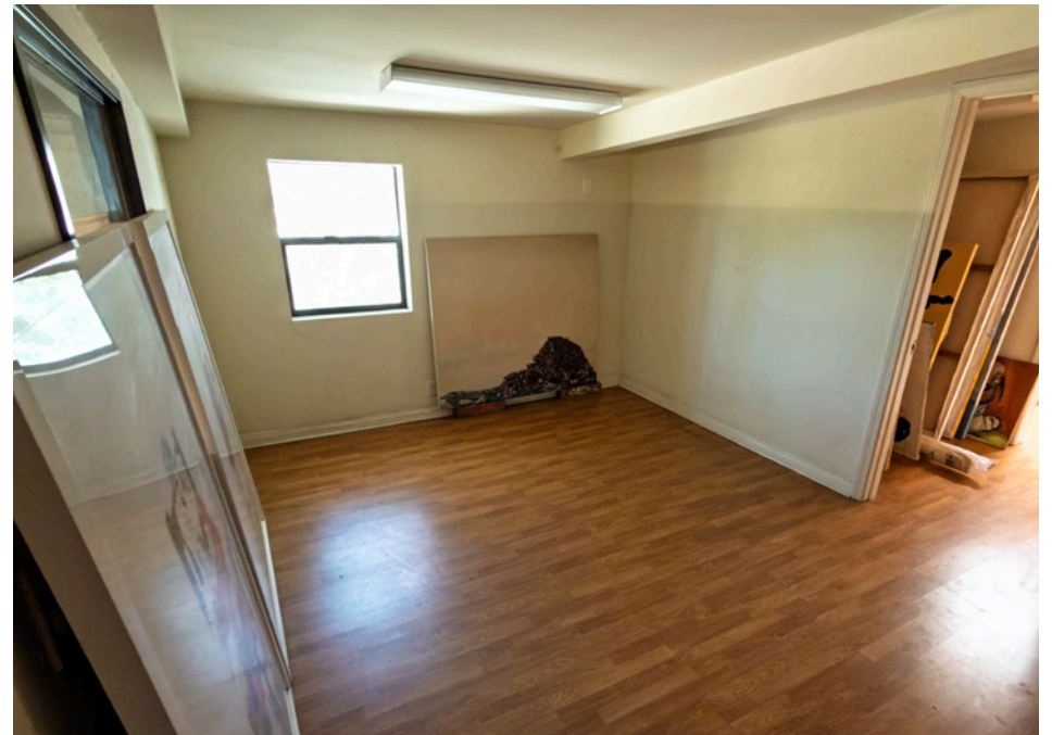
● 2nd office in the mezzanine