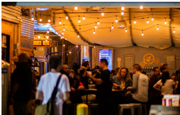
● Frogtown Brewery