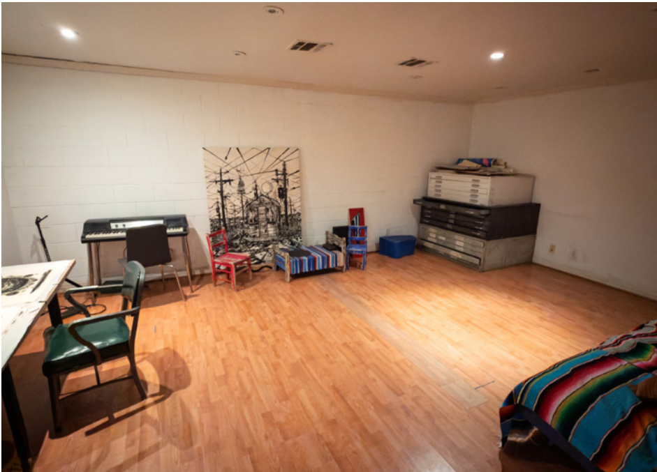
● 2nd office / studio on the ground floor