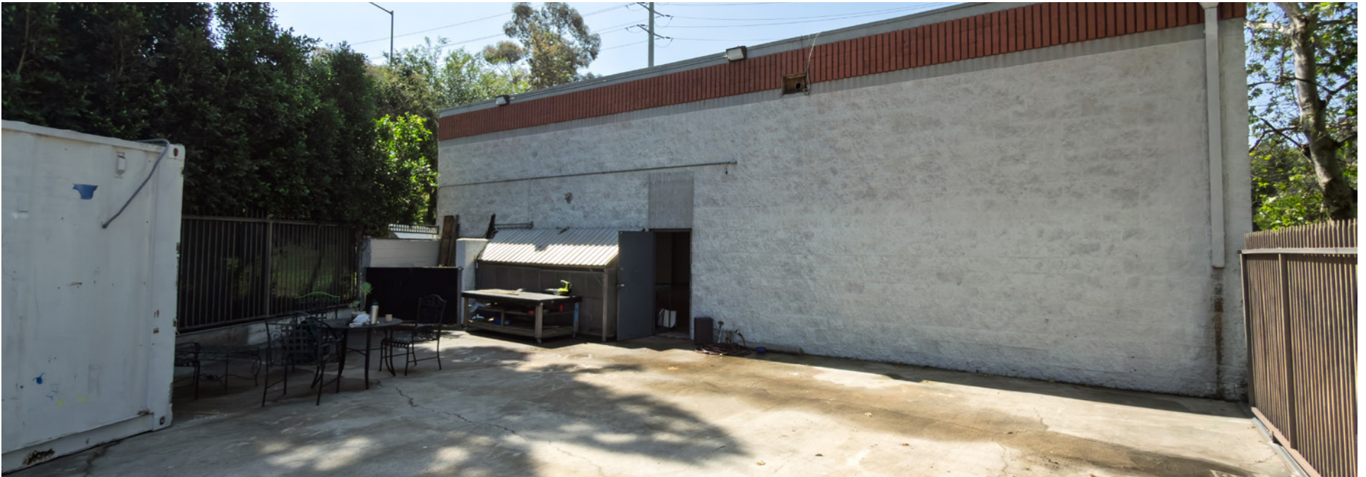
● The secure outdoor area and side entrance, along with the storage container