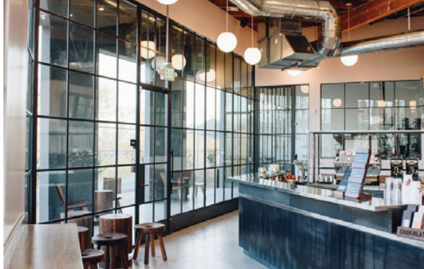
● La Colombe Coffee

2860 Glenview Ave sits at the eastern end of this corridor, walkable to Frogtown's signature destinations and within easy reach of Atwater Village and Silver Lake.