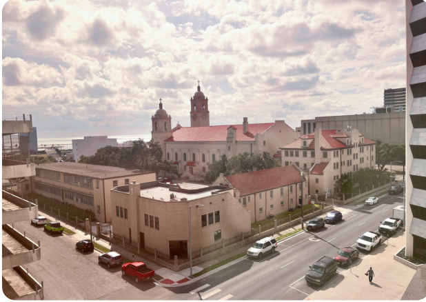
Partial Bay View