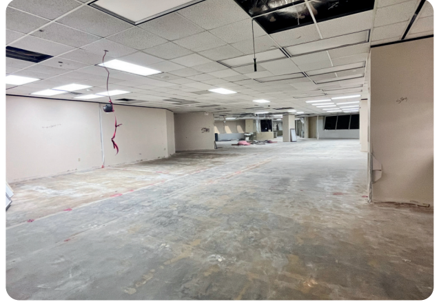
Current Shell Space