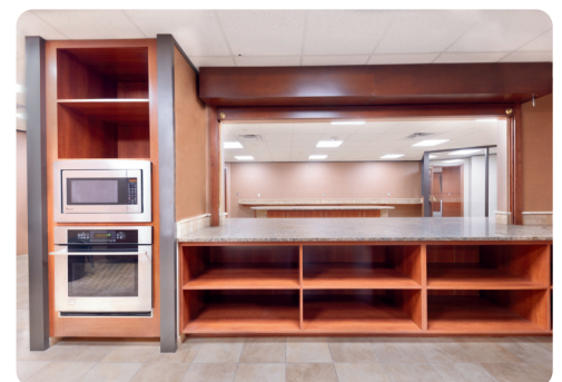
Building Conference Rooms