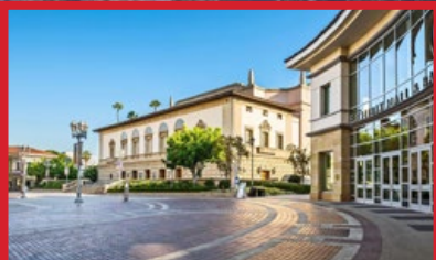
PASADENA CONVENTION CENTER