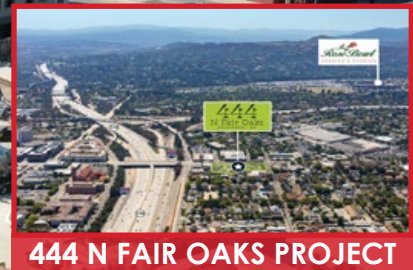
444 N FAIR OAKS PROJECT