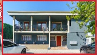
425 N RAYMOND AVE

Daily errands can be accomplished on a bike.