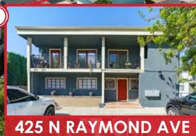
425 N RAYMOND AVE

Walk Score 87 Very Walkable Most errands can be accomplished on foot.