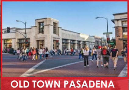
OLD TOWN PASADENA