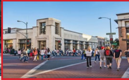
OLD TOWN PASADENA