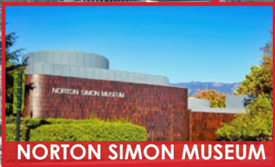
NORTON SIMON MUSEUM