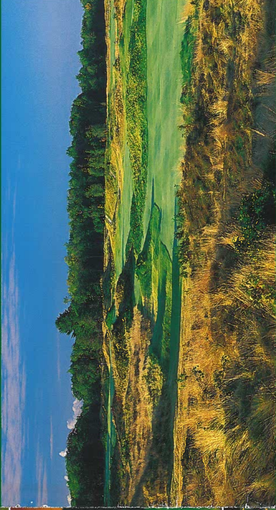
Gailes #11 - Michigan's only #1 best new resort course. By Golf Digest 1993.