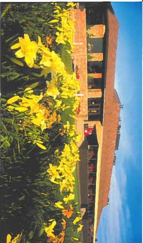
Lakewood Shores Clubhouse