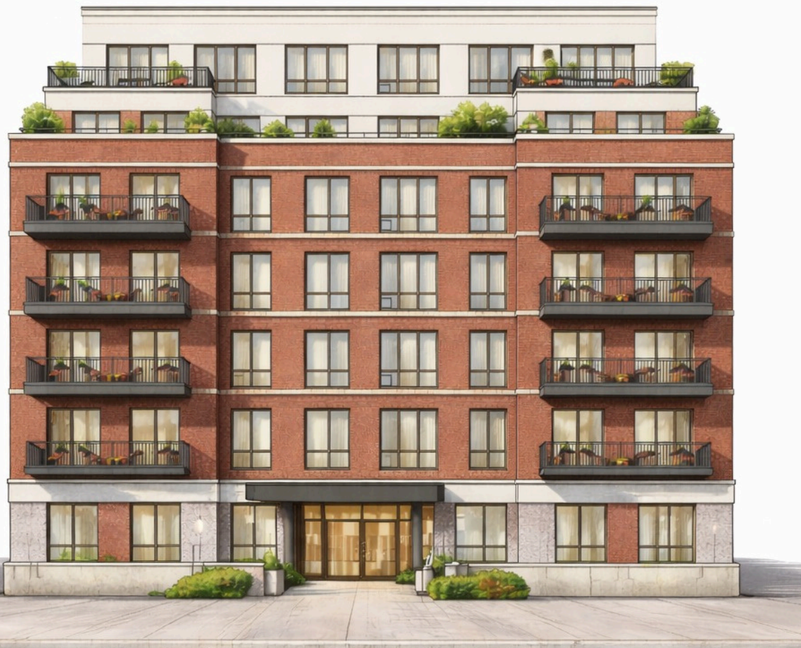
Artist Rendering for Subject Property