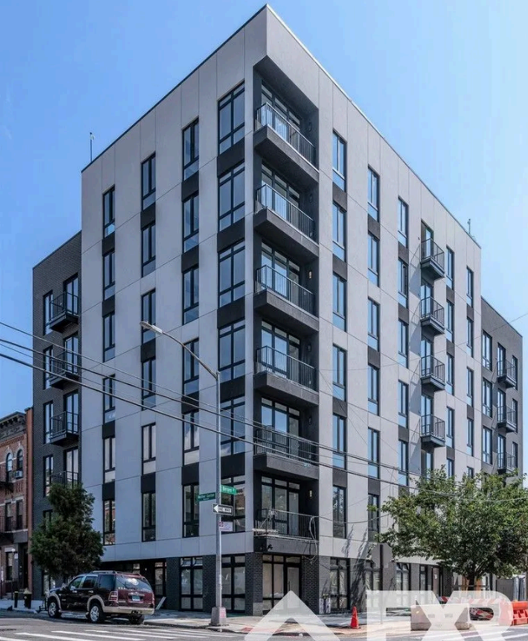
Recent completed Mixed-Use Building within 100 feet of Subject Property address 2175 Bergen Street