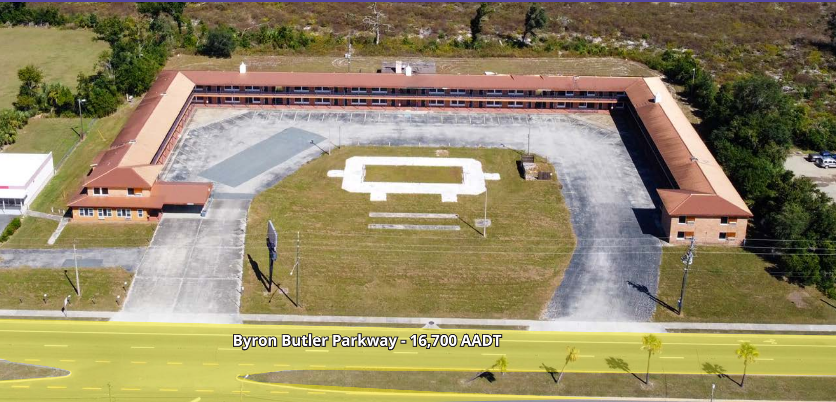
Byron Butler Parkway - 16,700 AADT

2238 S Byron Butler Parkway | Perry, Florida 32348