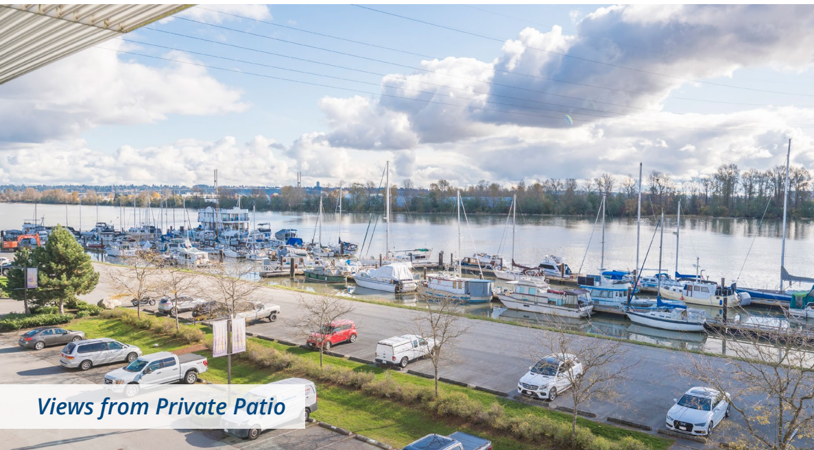
Views from Private Patio