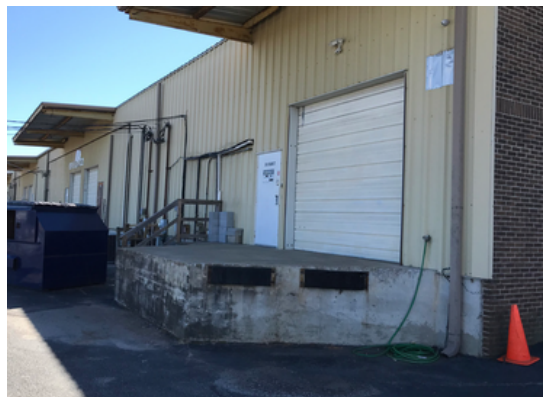
GREENVILLE COUNTY TAX MAP #0533030105100