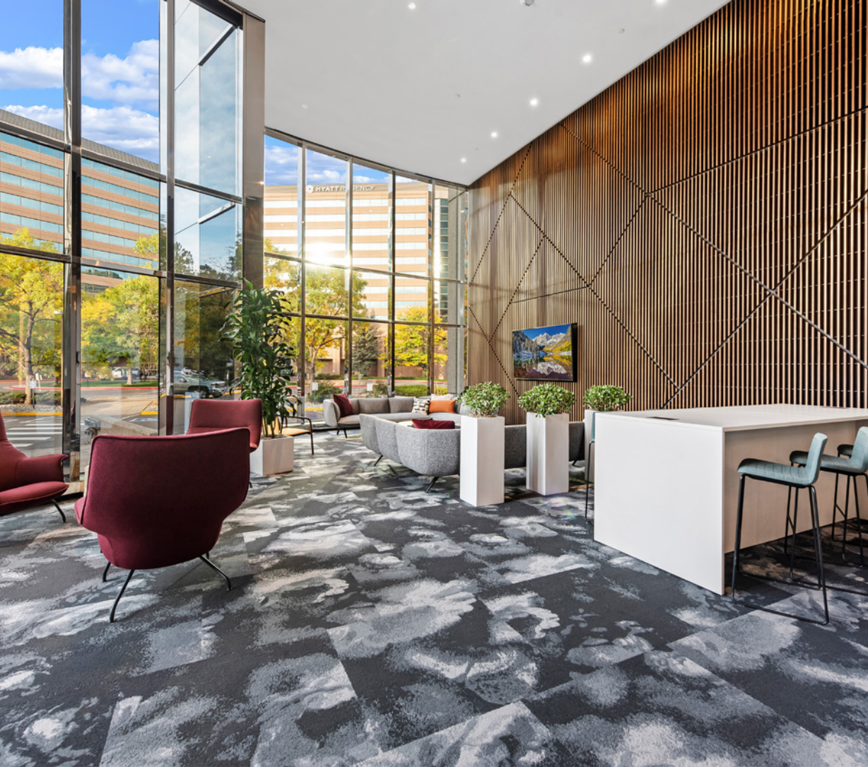
New Vibrant & Dynamic Lobby