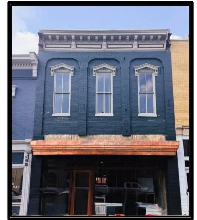
FIGURE 1: 541 Main Street (South)