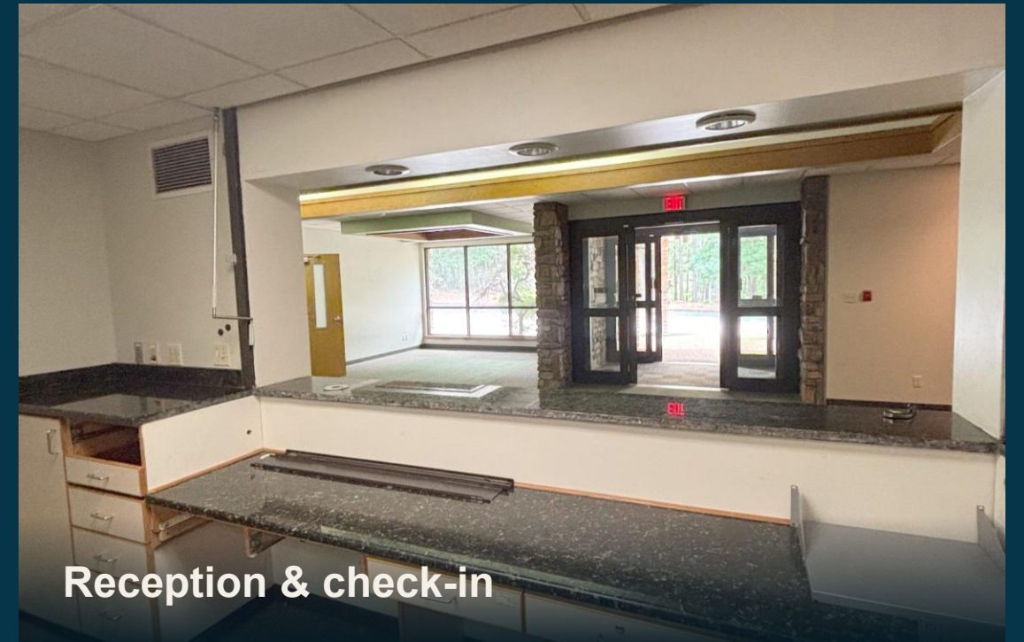
Reception & check-in