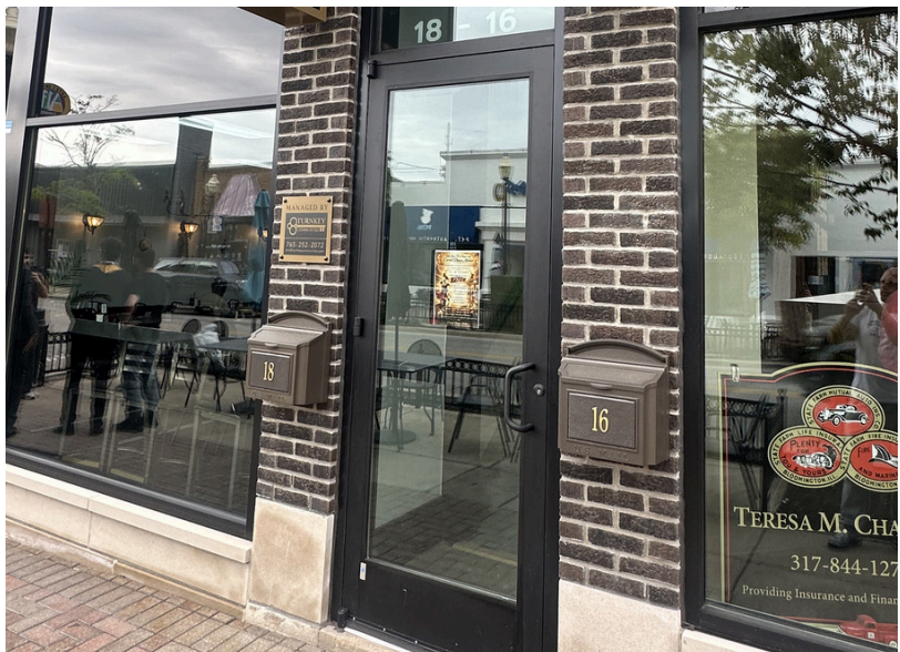
16 W Main Street, Carmel