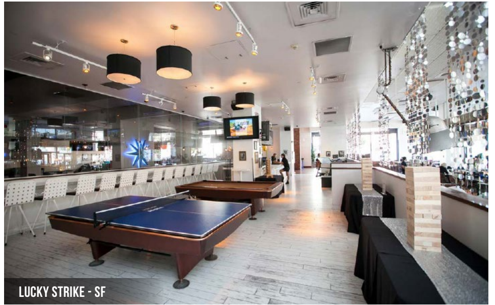
LUCKY STRIKE - SF