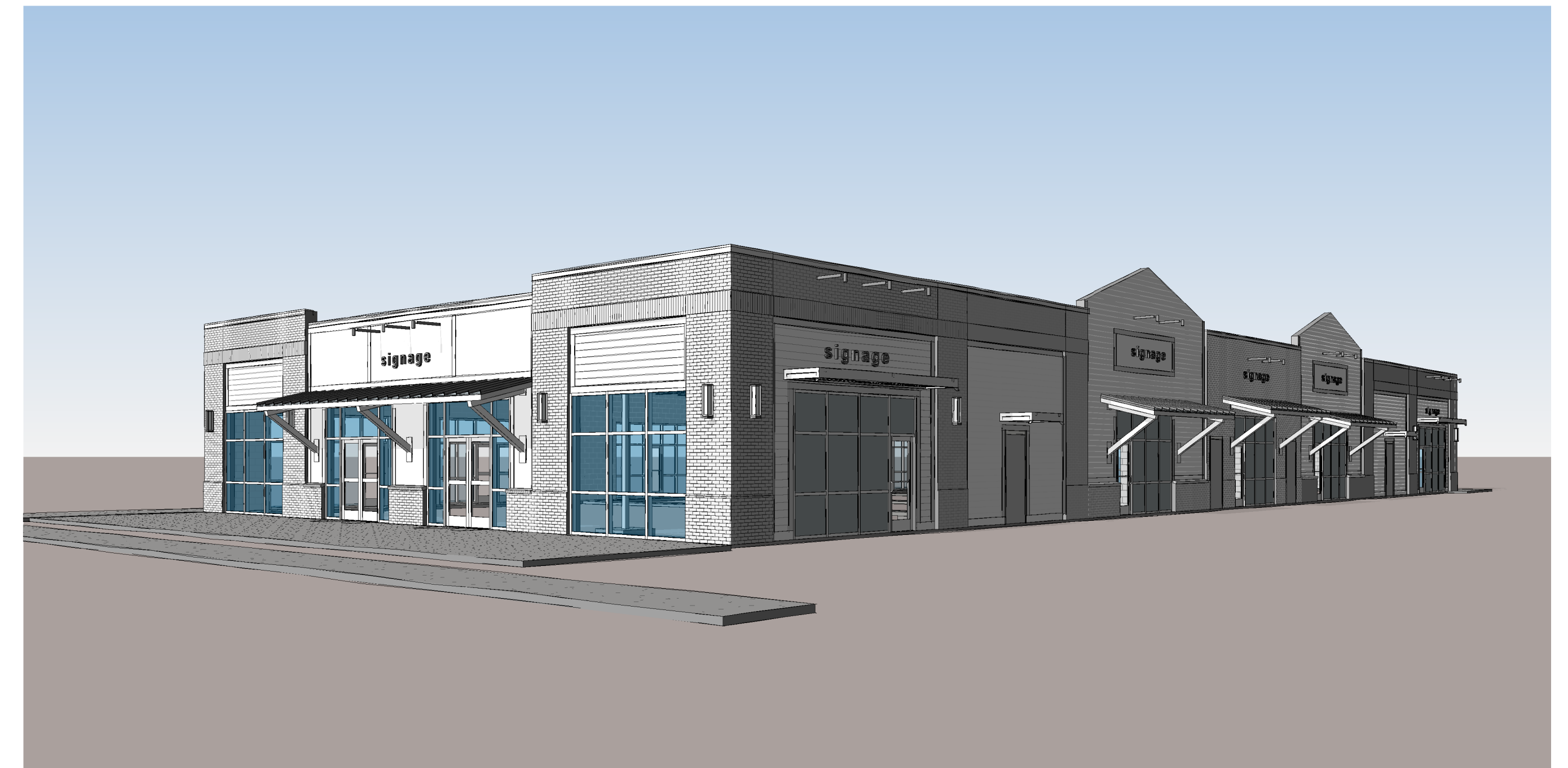
5 3D - BLDG B - HWY 52