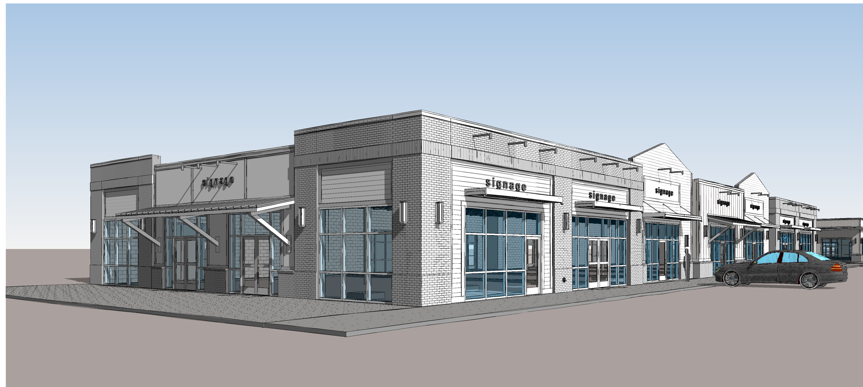
3 BLDG B - VIEW FROM PARKING