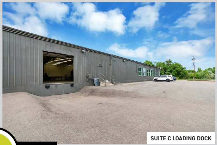
SUITE C LOADING DOCK