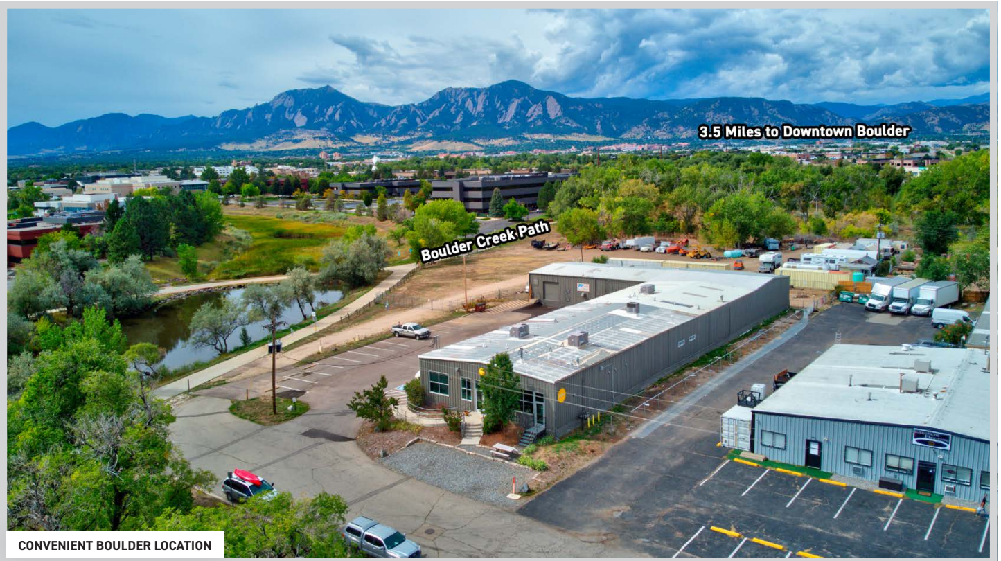
CONVENIENT BOULDER LOCATION