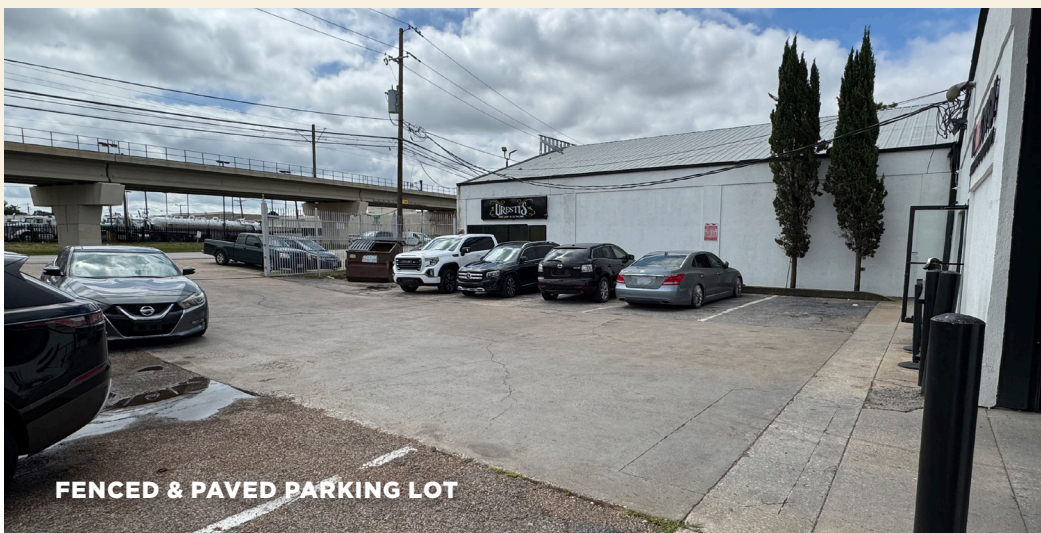
FENCED & PAVED PARKING LOT