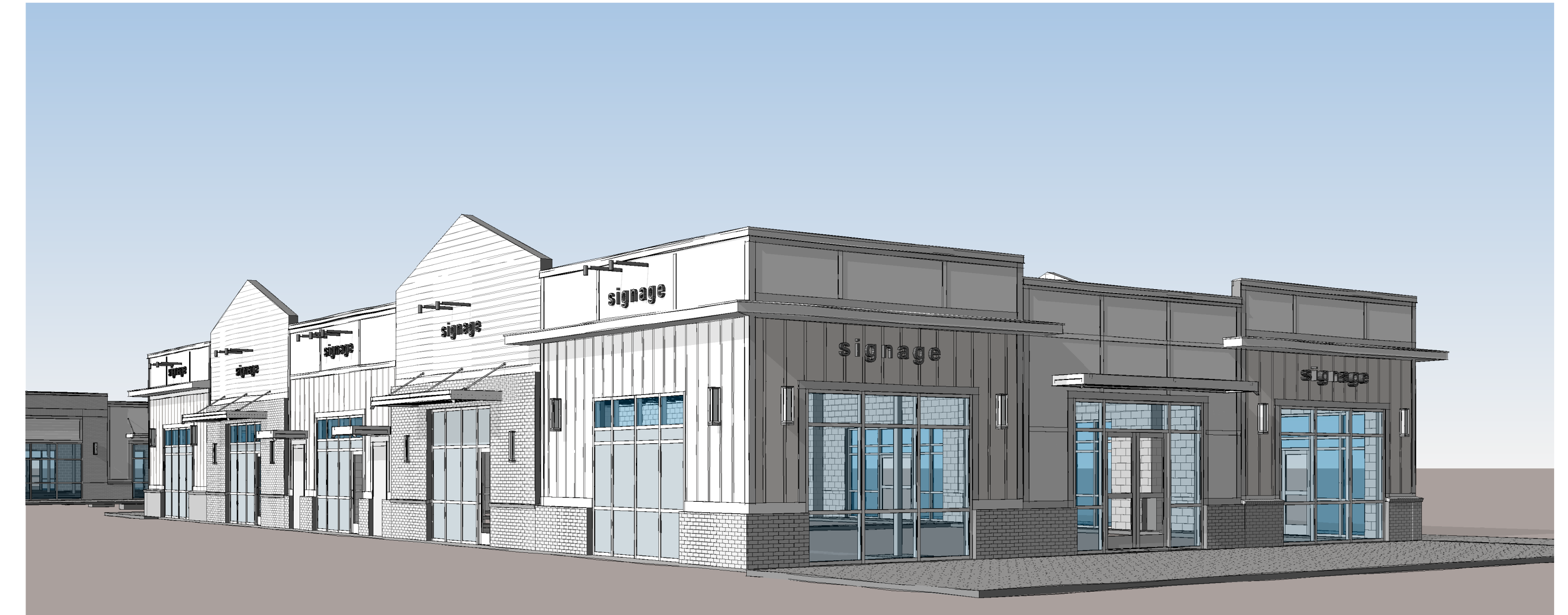
5 BLDG D - VIEW FROM 52