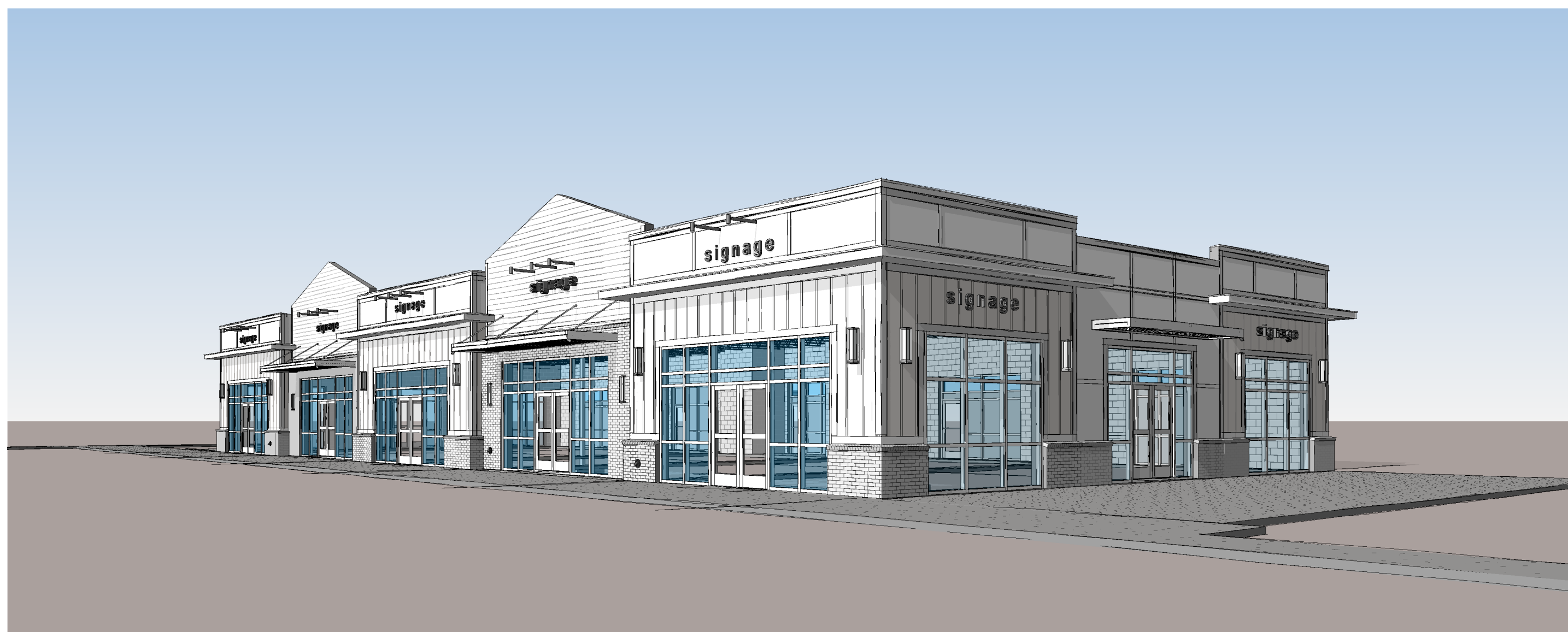
3 BLDG D - VIEW FROM PARKING