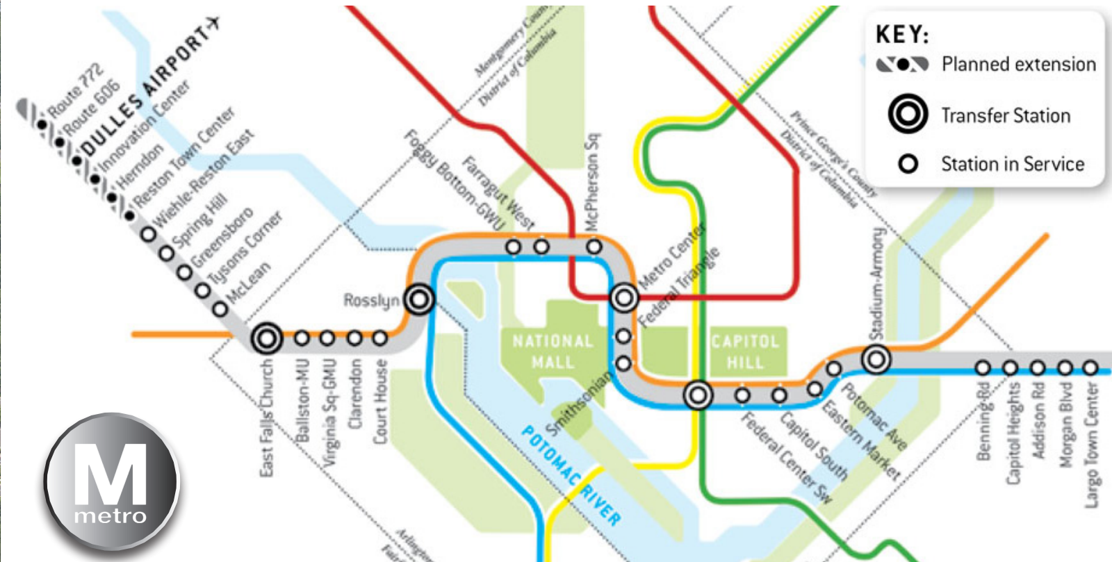
DULLES INTERNATIONAL AIRPORT