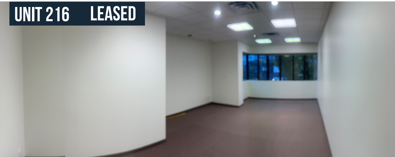
UNIT 216 LEASED