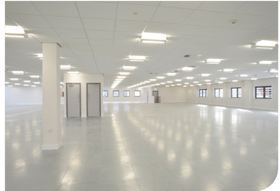
Picture of first floor offices

area of some 11,318 sq ft (1,051.47 sq m) which can be divided. Railway House also benefits from first class meeting rooms, with LCD presentation screens and teleconferencing facilities, which are available to hire.