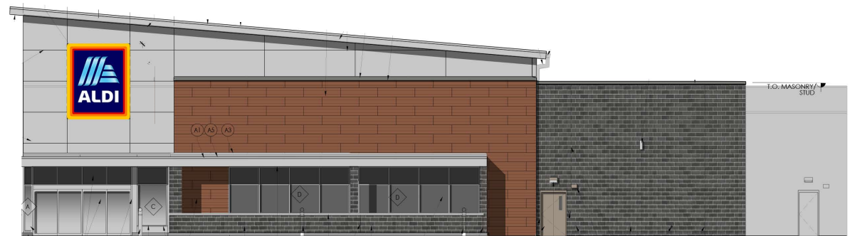
Front Elevation (North)