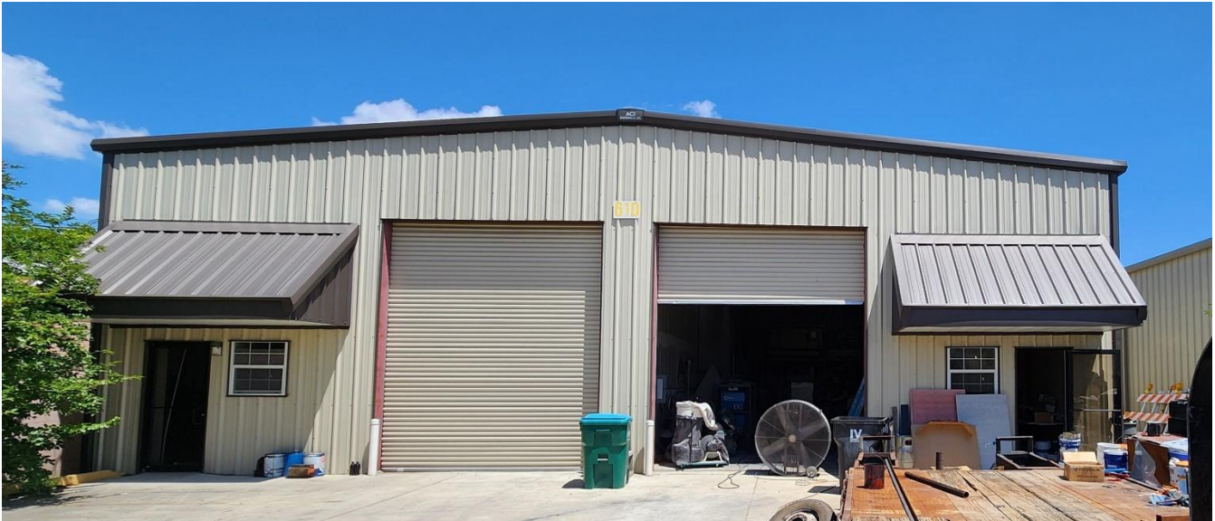
610A Maria St (left)