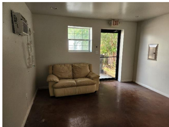
610A Office space