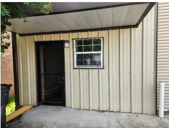
610A Office entrance