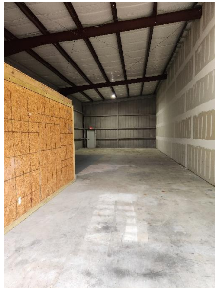
Warehouse looking from truck door