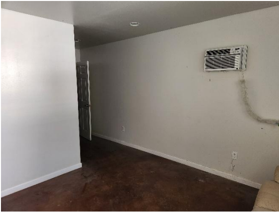
610A Office door to warehouse