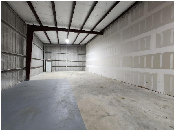
610A Warehouse space and back door