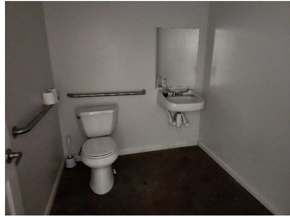
610A Rest room