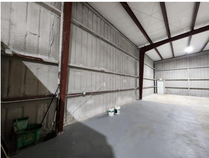
Warehouse looking from Office door