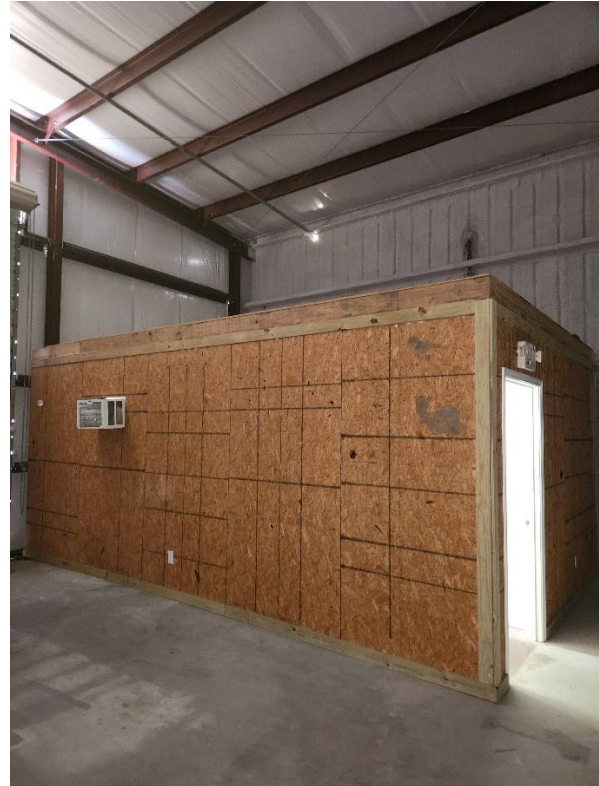
610A Insulated roof, office space