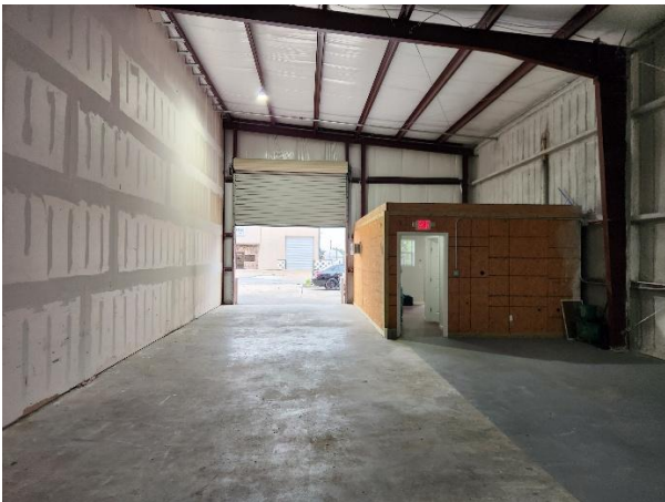
Truck door and office / rest room