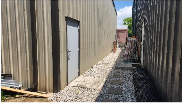
Back of building