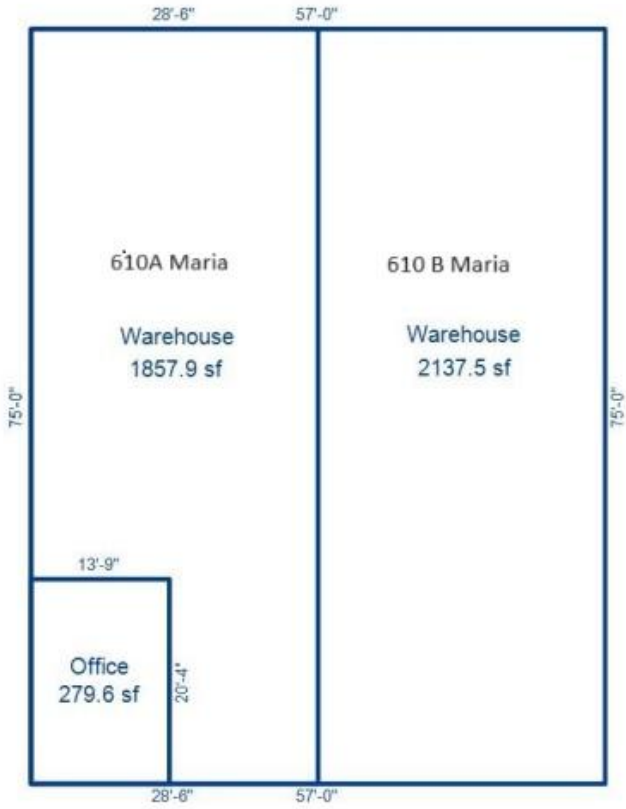
Dimensions (rest room in office space)