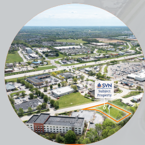
Walmart-Anchored Retail Corridor