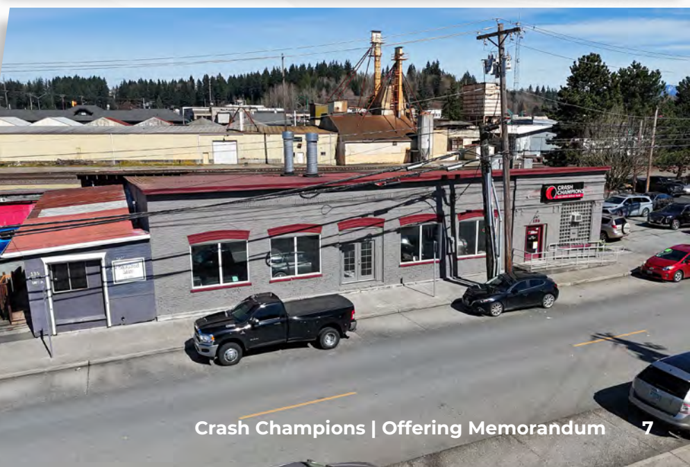
ACTUAL PROPERTY PHOTOS