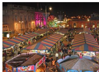
Ashton Markets – opposite subject site