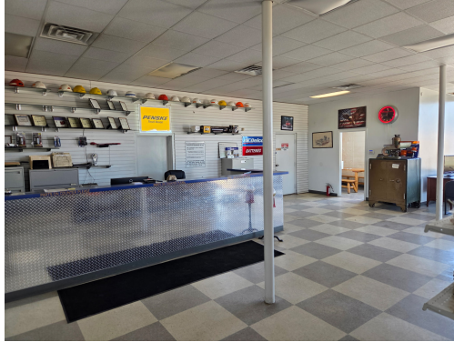
Diamond plate front counter