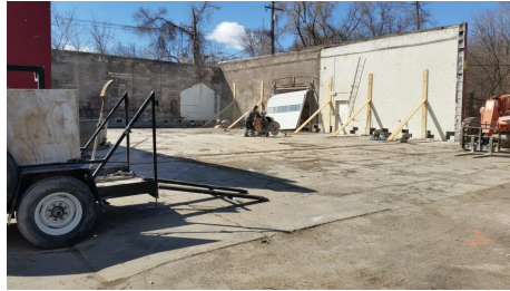
Reinforced west wall