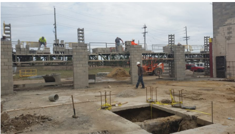
New north wall for new overhead doors