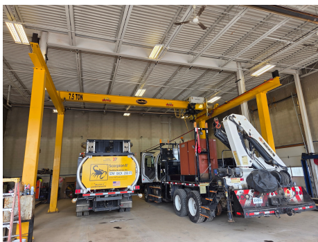
Bay 4 & 5 with crane