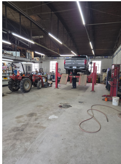
Bay 1 & 2 with Hunter alignment