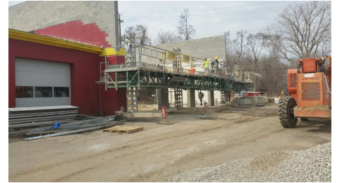
All walls and ceiling raised