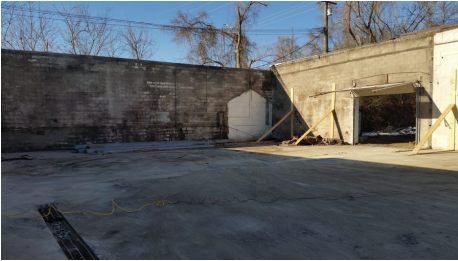
Rear shop gutted — start of demolition

The August 2015 remodel was a complete structural overhaul of the rear shop. All walls and ceiling height were raised, the west wall reinforced, a new north wall built for new overhead doors, and reinforced concrete footings poured for the freestanding 7.5-ton TRSG cranes. The remodel included a complete new roof with structural steel and decking.