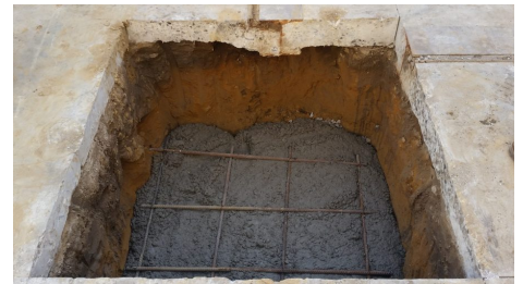
Crane footing — pour complete