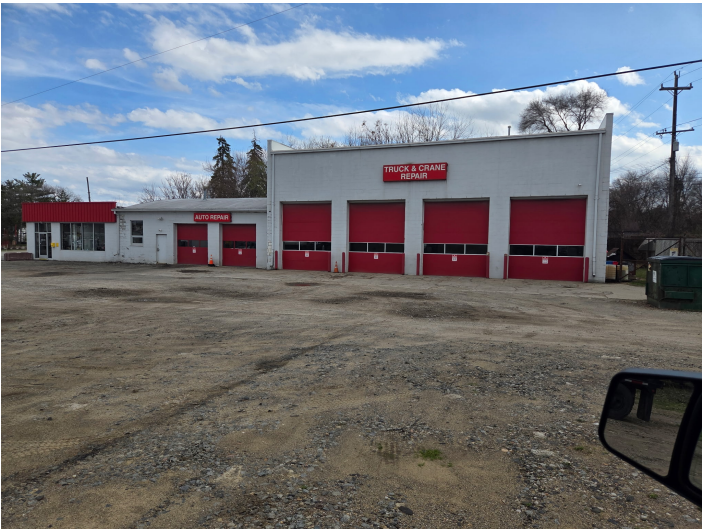
Building & paved customer parking