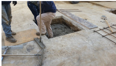
Crane footing — formwork