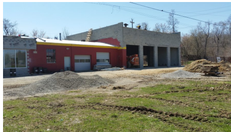
Block work complete — rear shop