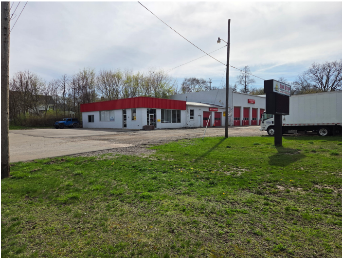
Building exterior & sign frontage on S Baldwin Rd

9,210 SF Commercial Building - 222 ft Baldwin Rd Frontage 20,000+ Daily Traffic - 1.2 mi from I-75 Steady Recurring Fleet Customer Revenue