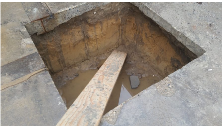
Crane footing — excavation & rebar