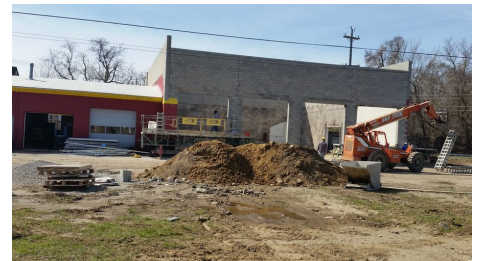
Completed rear shop

All measurements and descriptions are broker-provided and subject to final confirmation during due diligence.