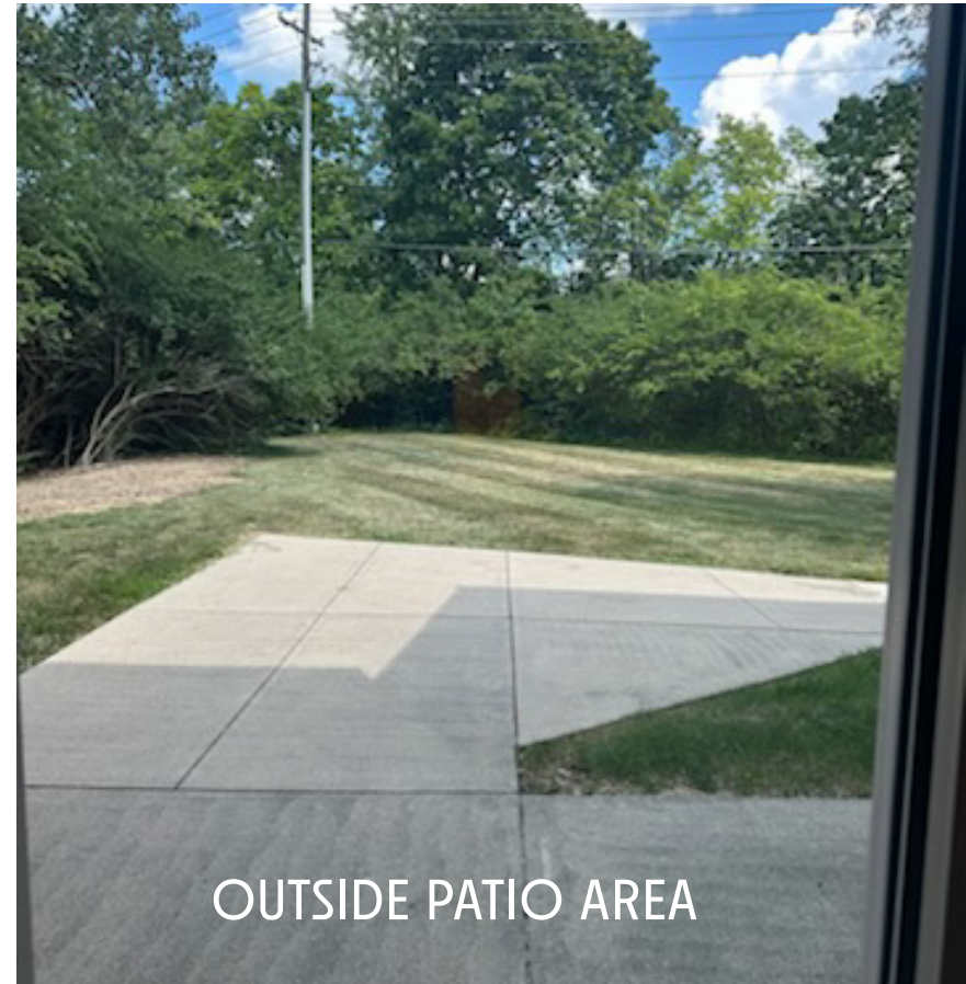
OUTSIDE PATIO AREA

For more information on this property, please contact: