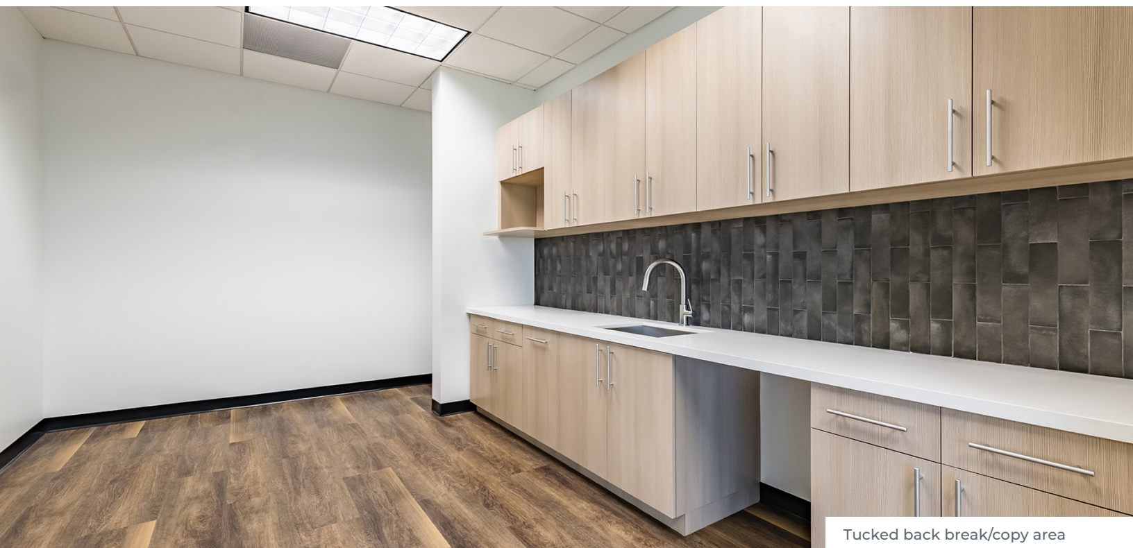
Tucked back break/copy area

For leasing information, please contact: