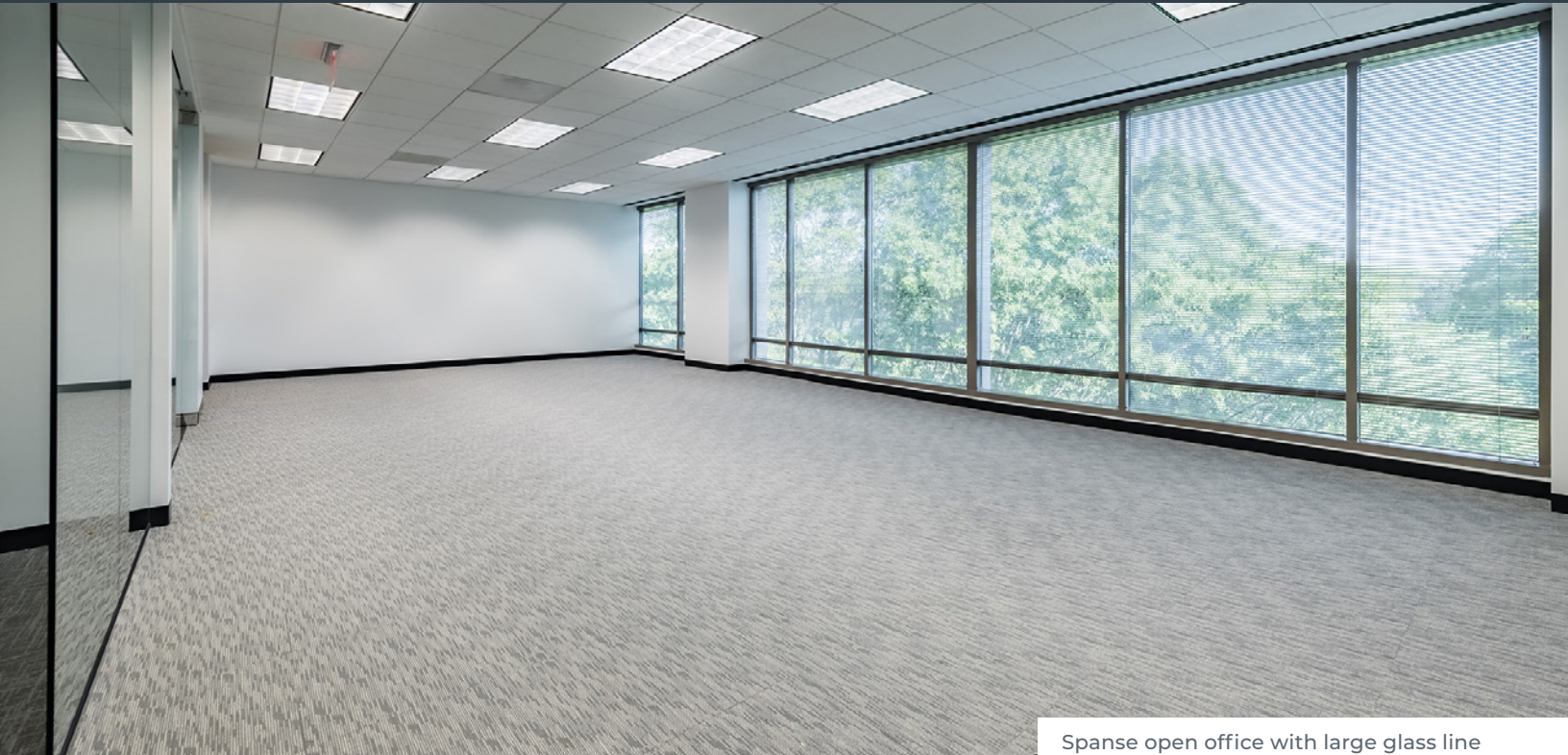
Spans open office with large glass line