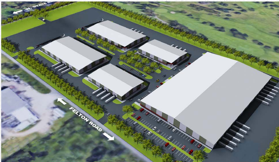
*Rendering depicts potential development of 20.5-acre site