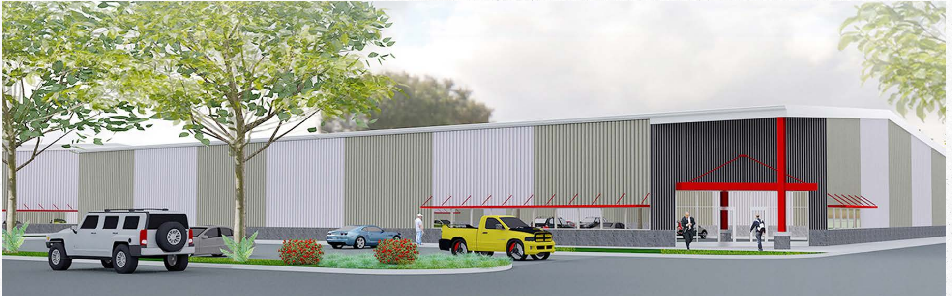
*Rendering of potential building